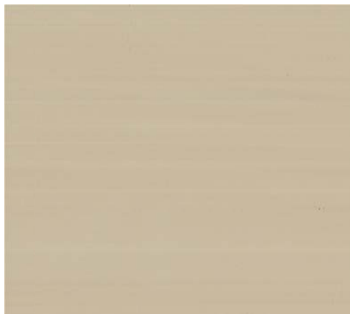
ES 530 Jersey Spot

Fencing stain or paint color by Hallman Lindsay of ES 530 Jersey Spot (or similar color by other manufacturer) is the only color allowed for wood material.