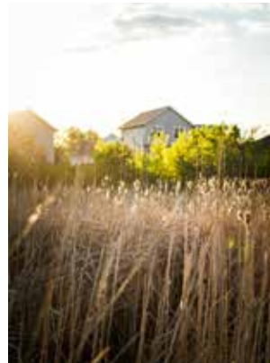
Photos are representative, not actual photos at The Meadows at Conservancy Place.